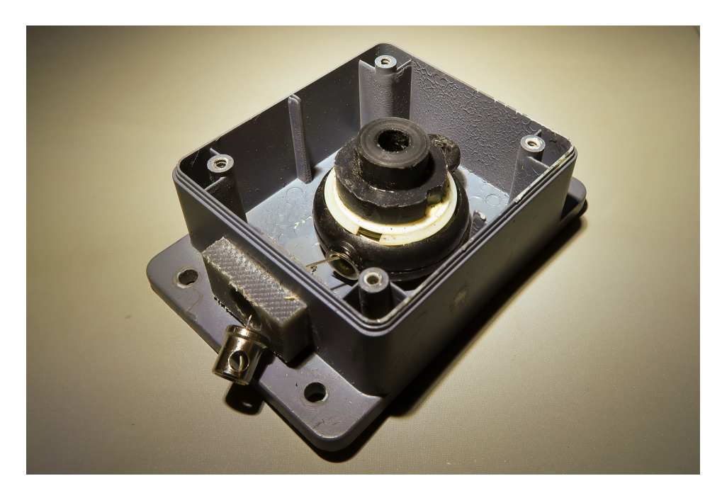
Figure 1: The base of the plastic box. Note the hole to enable the string to leave the box. Also the protective sleeve to stop the string rubbing the edge of the box. The spool is glued to the base of the box. The shaft of the potentiometer slides into the hole at the top of the spool when the lid is secured.