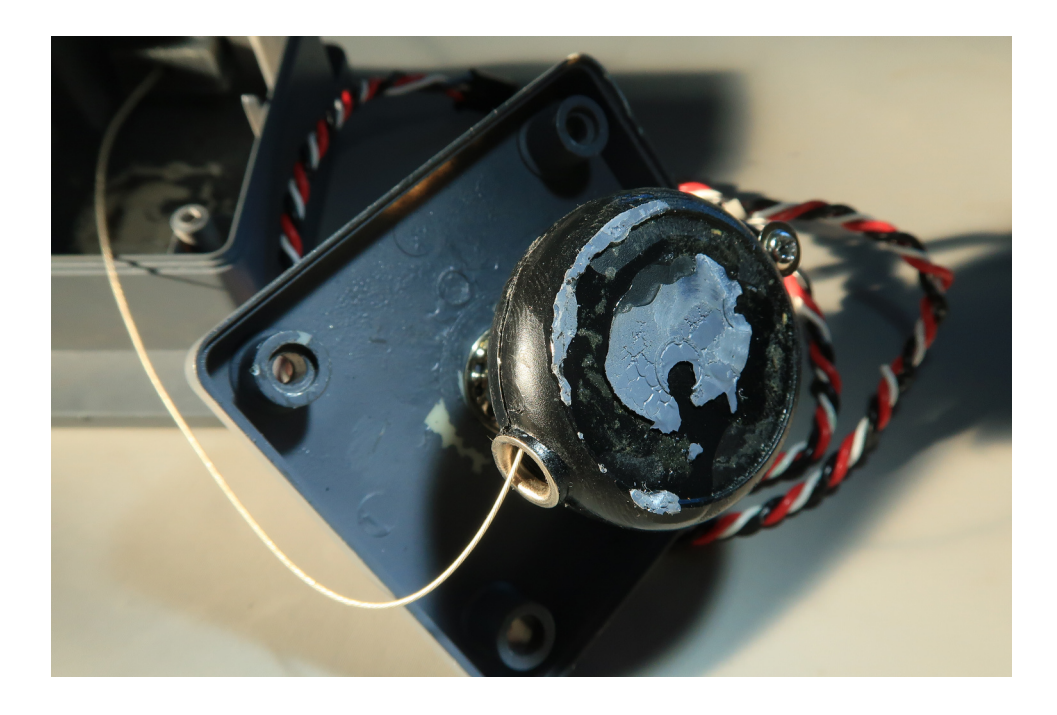
Figure 5: Another view showing the base of the spool. The spool is attached to the shaft of the potentiometer which has been inserted through the lid of the box. The red, white and black cabling come from the base of the potentiometer. The discolouration on the base of the spool is old glue ( from when I dismantled the unit to take photographs ).