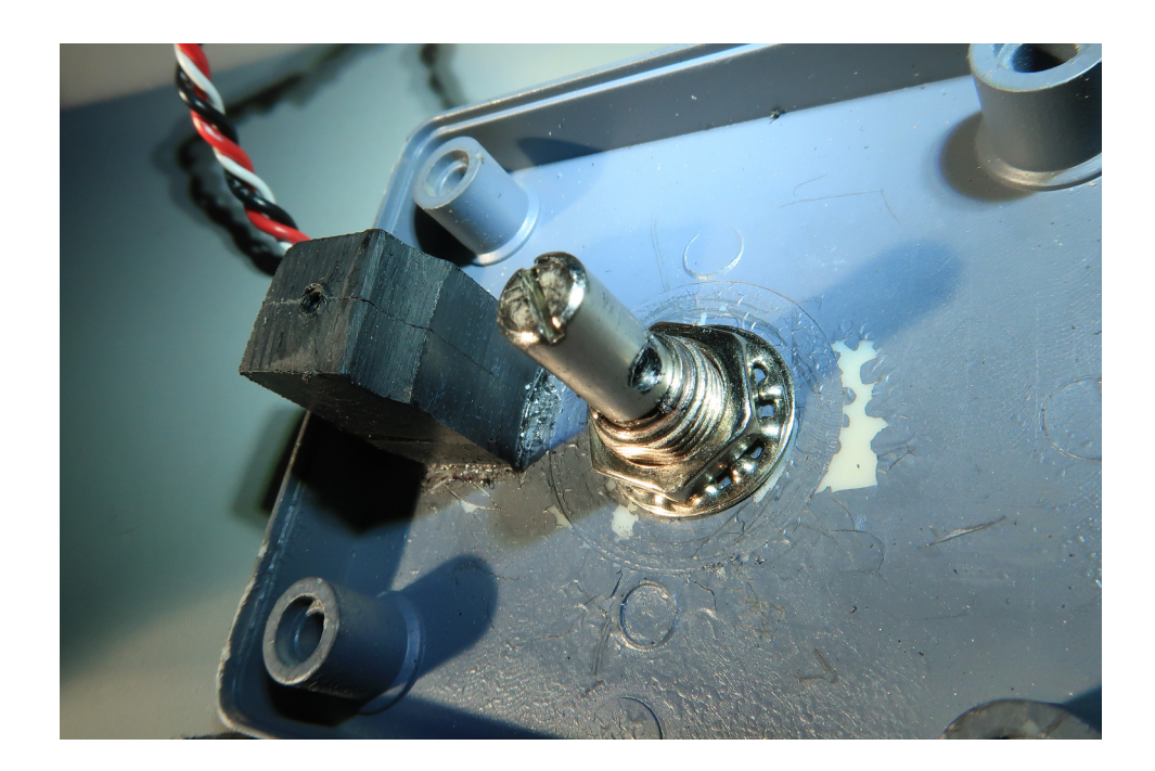
Figure 2: The inside lid of the box with the shaft of the potentiometer secured by a nut a washer. Note the hole that has been carefully drilled into the shaft. This hole aligns with the hole drilled in the side of spool (Figure 3). A screw secures them together to stop the spool from free spooling. The piece of ABS plastic with a small drill hole is also seen .