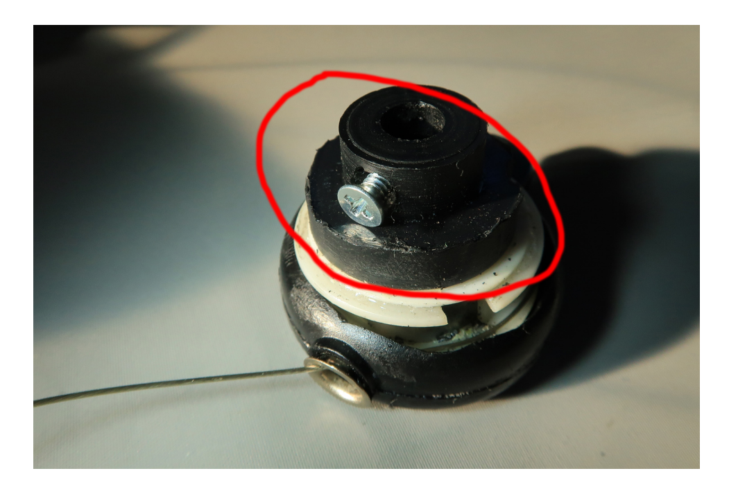
Figure 3: The retractable spring-loaded spool removed from the base of box. Note the screw which is used to secure the spool to the shaft of the potentiometer. Also note that the two-tiered ,black-coloured cylindrical attachment (with the screw). This has been fabricated from ABS plastic and glued to the spool (circled in red).