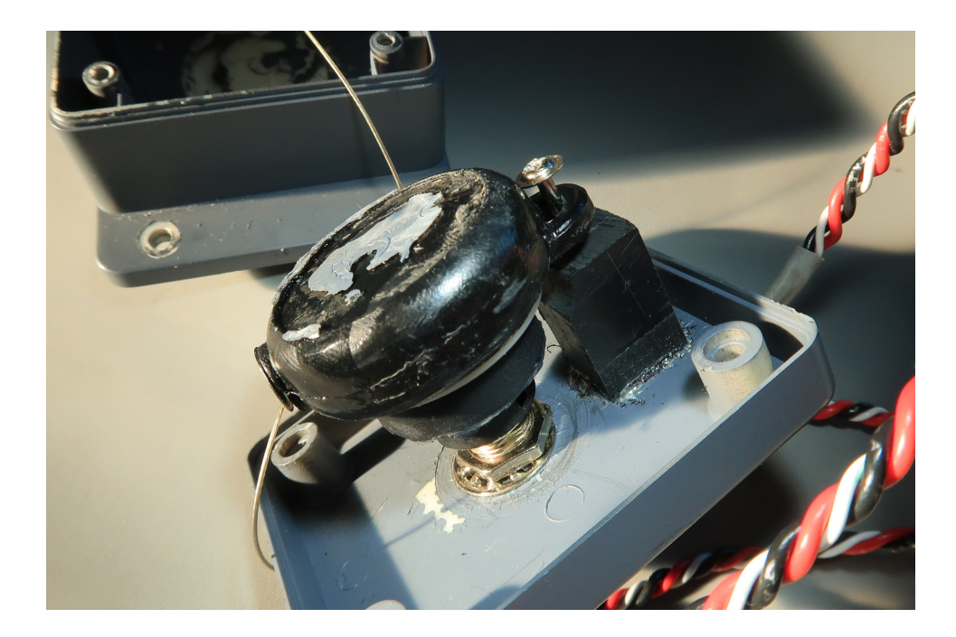
Figure 4: The lid of the box showing the retractable spool secured to the shaft of the potentiometer. The discolouration on the base of the spool is old glue (from when I dismantled the unit to take photographs). Note the screw attached to the piece of ABS plastic. This screw helps to secure the spool.